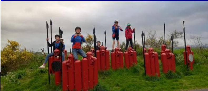
The girls on their bike ride and at the Mayfest at the primary school raising fund for the London trip.