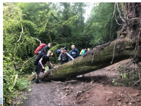
The Silver boys overcoming one of several obstacles, with their usual good humour.

This is the BBs 140 th year and we continue to promote fun, adventure and creativity with a distinctively Christian ethos.