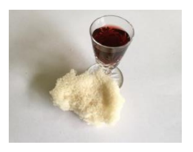
Sunday 7th February 10.30 am

(online at St Machar's Ranfurly Church YouTube)