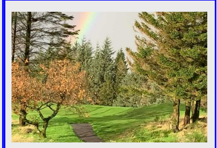
Rainbow over Ranfurly Castle Golf Course

If you would prefer a printed copy of the Service please let your Elder know.