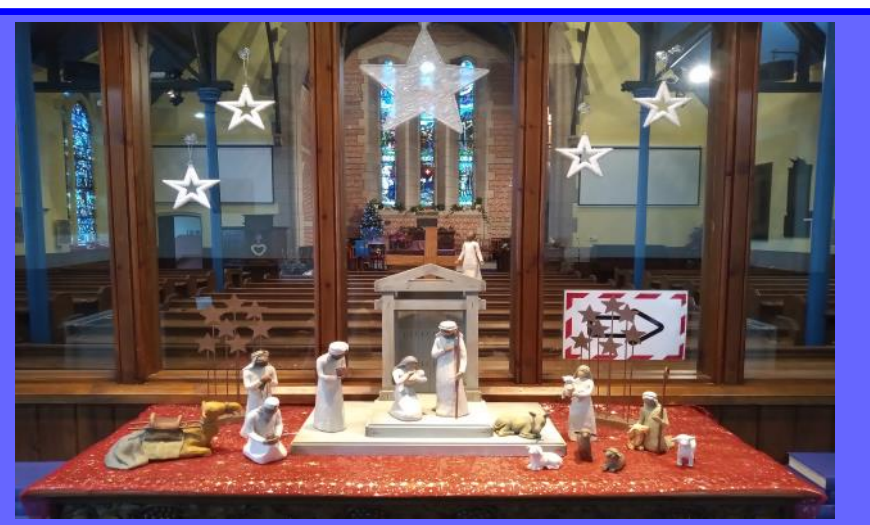
Front Cover