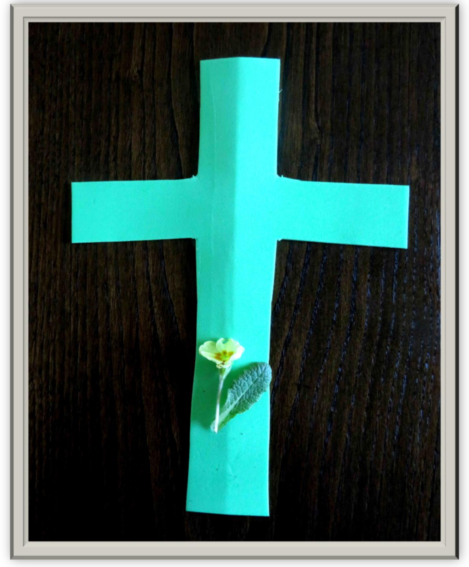
St Machar's Ranfurly Church, Church of Scotland, Bridge of Weir. Scottish Charity No. SC003766